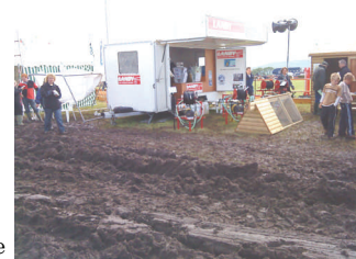
Egton Show 2008.

Hopefully next year the weather will be better! We'll start next year with LAMMA show in January. Keep a check on our website to see which shows we're doing throughout the year.